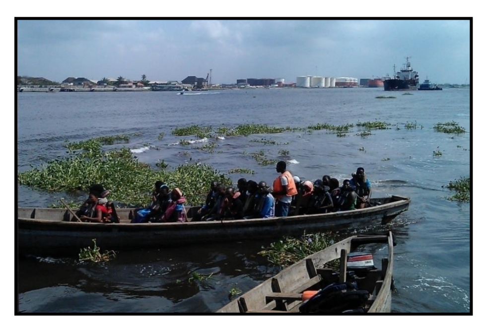
Plate 1: Wooden boat