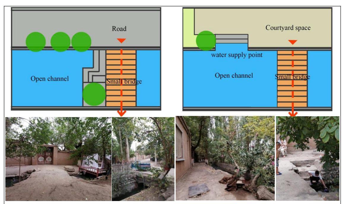
Figures 4 Multiple combination forms of street-facing water system and grape courtyard landscape. Self-drawn by author, Photographed by author.