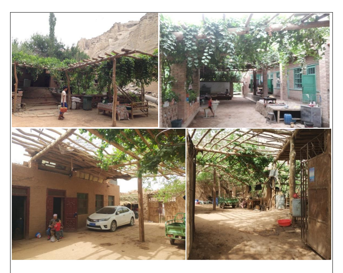
Figures 2 Construction of shade space in the courtyard of Grape village.