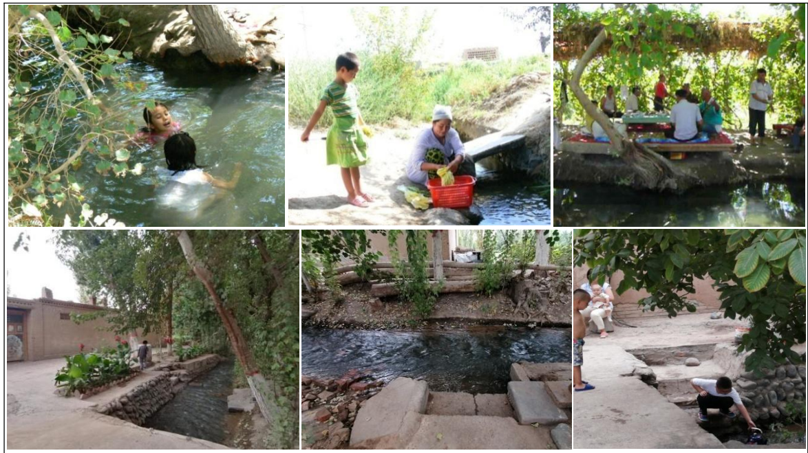
Figures 3 Construction of near-water and hydrophilic space in Grape village.

under the house as a place to rest at night. The open-channel flows, the water gurgles, the central canal system connects with the branch canal, the overflow system runs along the streets and lanes, and the clear water surface with different widths has become a place for children to play by the stream in summer (Kang, Wang, 2019). Daily activities such as water collection and raccoon washing along the canal, the waterlogging dam space form a gathering place for residents, which constitutes a vivid daily water landscape under the oasis pattern in arid areas, which is also the essential feature that distinguishes it from other oasis rural landscapes. Residents have established a beautiful and fertile water landscape and a beautiful oasis garden.