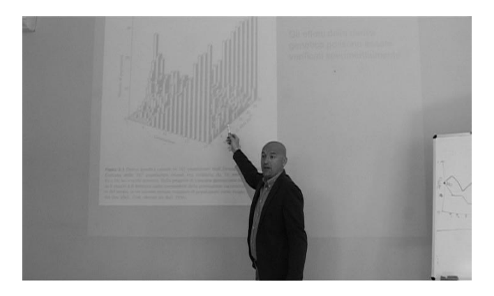
figure 1 - "Sparring" model (University of Siena source)

From the "Genetics of populations and conservationist" course of degree in Biodiversity and Nature Conservation, "Genetic drift" lecture was chosen. From this educational content two concepts have been extracted, which were used in experimentation: "Biodiversity and Nature Conservation" and "Genetic drift and natural selection". For each of the two concepts, two prototype video content have been developed, using both the model "Sparring" (figure 1) and the "USiena" model (figure 2).