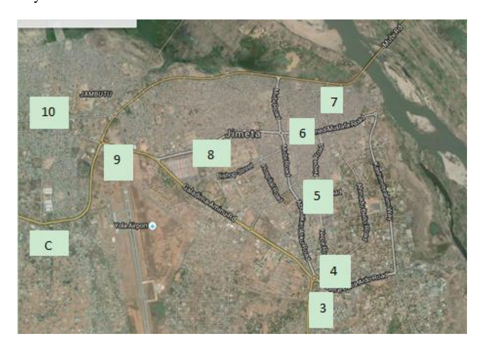
Figure 1: Map of Jimeta Showing the Study Areas.

Ten locations were selected for the study along the major roads in Jimata/Yola metropolis, as shown in Figure 1. It shows the major roads and sampling areas in Yola metropolis. These locations includes; Yola town market (location 1), Jippu-Jam round about (location 2), AA Lawan (location 3), Police roundabout (location 4), Jimeta shopping complex (location 5), Mubi roundabout (location 6), Hayin gada (location 7), Jimeta-ultra market (location 8), Airport roundabout (location 9) and Janbutu market (location 10), farm center (location C). A location in a farm far beside FGGC Yola was used as control site, which was neither close to houses nor any main road.