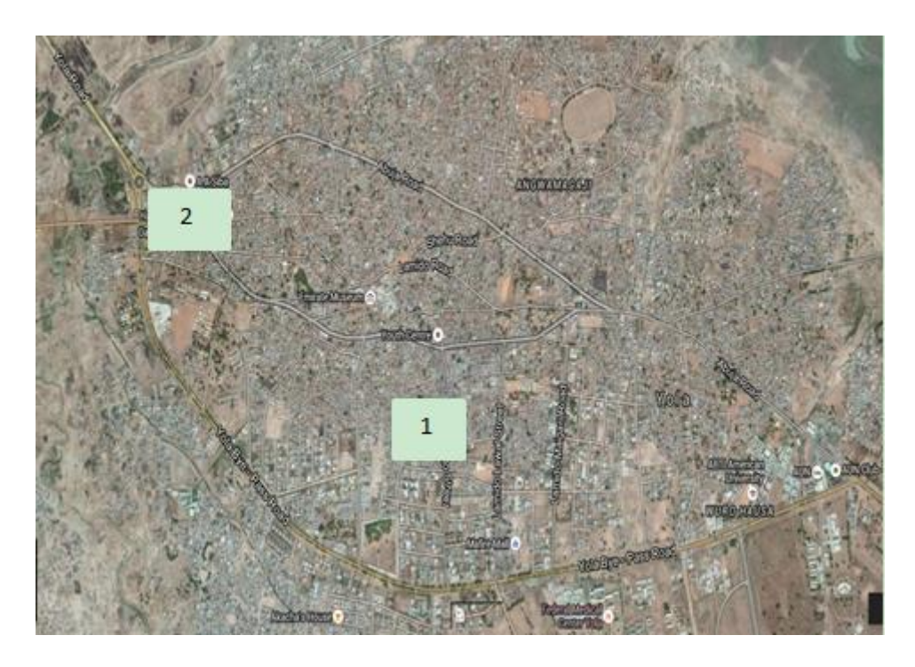
Figure 2: Map of Yola Town Showing the Study Areas (Google Map, 2015).